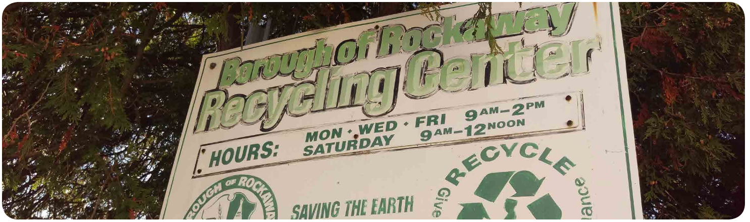
Recycling Center located behind Rockaway's Community Center